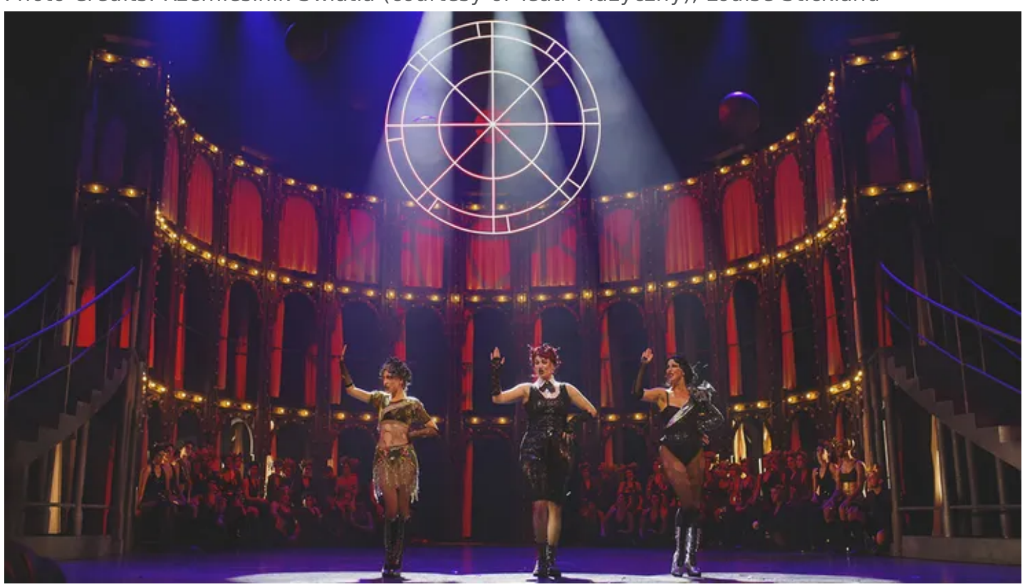
Photo Credits: Rzemieslnik Swiatla (courtesy of Teatr Muzyczny), Louise Stickland

The original part of the Main stage – remaining from before the 2013 refit – has only 3 lighting bridges, so some of the lighting positions are limited, but as the FORTES are so useful and multifunctional, Bartosz reckons that 43 fixtures can easily do the job of many more profiles, spots, beams and washes – with just one unit instead of 4 of different types of light!